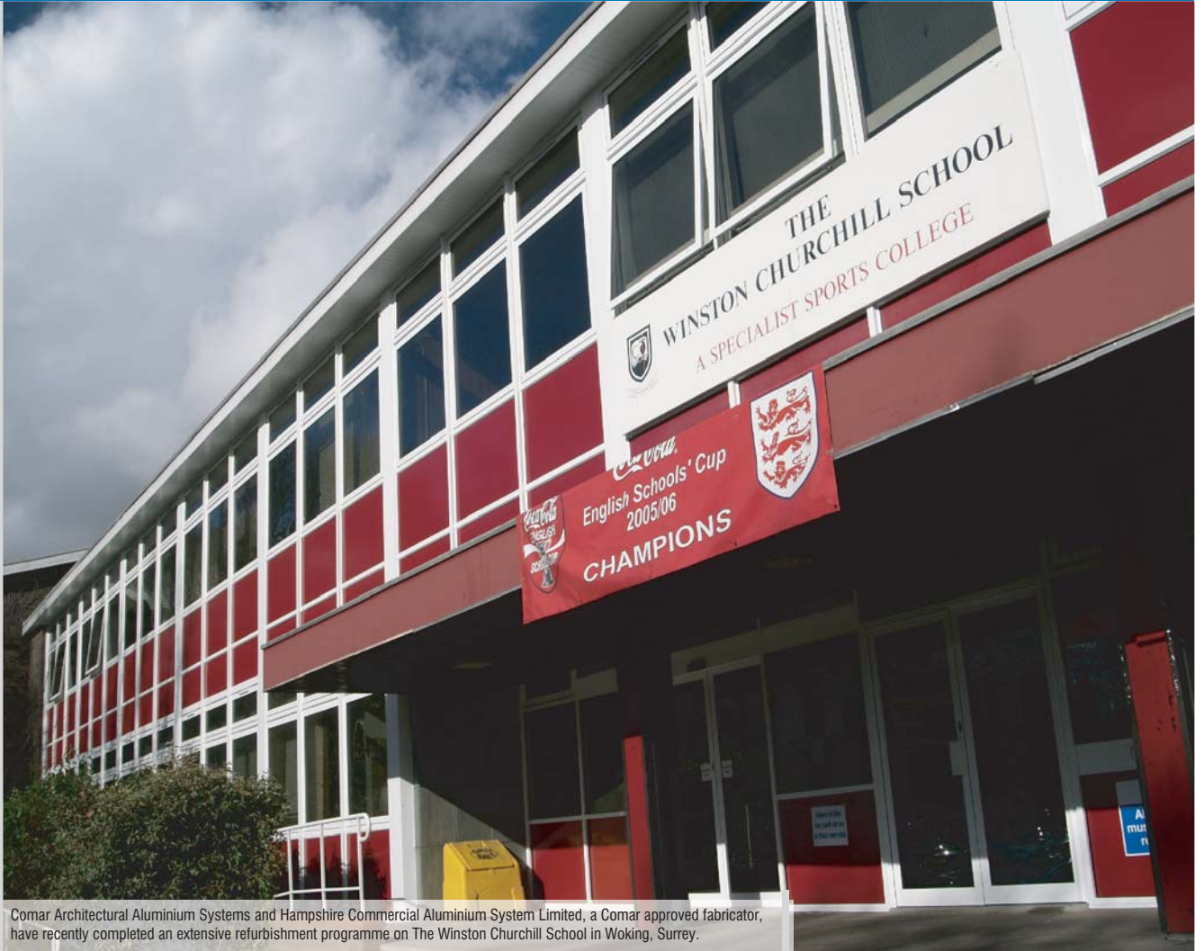
Comar Architectural Aluminium Systems and Hampshire Commercial Aluminium System Limited, a Comar approved fabricator, have recently completed an extensive refurbishment programme on The Winston Churchill School in Woking, Surrey.

One of the elevations consists of a two-storey, 200m span of cladding, originally timber, which had reached the end of its life cycle. To totally update the building Comar 2 window walling was specified with integrated top-hung opening vents and panels. Comar 2 offered a precise fit to the specification requirements of the building, offering fast-track installation, a wide range of glazing options, integration, security, high-span mullions and transoms