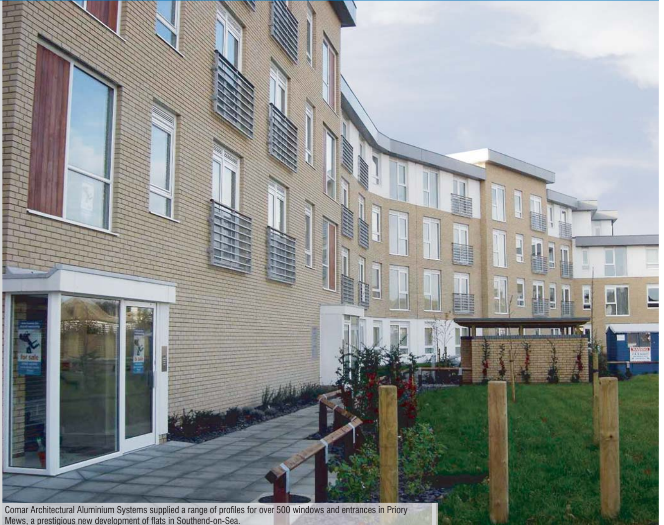
Comar Architectural Aluminium Systems supplied a range of profiles for over 500 windows and entrances in Priory Mews, a prestigious new development of flats in Southend-on-Sea.

The building's appearance was strongly influenced by the setting. Priory Park is an important cultural and recreation venue and the design of the facade ensured the building appeared sympathetic to the surrounding parkland. ATP Architects envisaged a building with two to five-storey elevations which gave the building a discreet but unconventional look. The envelope consisted of plain white plaster walls with sand coloured brickwork, wood panelling and white coloured fenestration. The entire ensemble brought dynamism and animation to the facade.