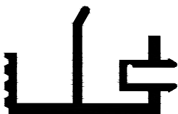
CS633 Full Scale